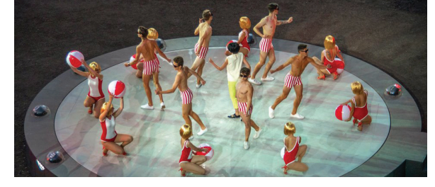
"Nightingales of Kreml", Tartu New Theatre.