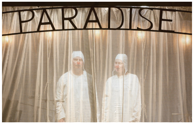
"Cabaret Siberia", Piip and Tuut Theatre.

There were 77 summer productions (performed from the end of May until the end of August, mostly outside of the theatre buildings, in nature, parks, manors or farm houses, castles, etc.) in 2018, of which 51 were new productions. Summer theatre performances have become very popular, and their numbers are increasing every summer. They are produced by both repertory theatres and projects brought together especially for summer performances.