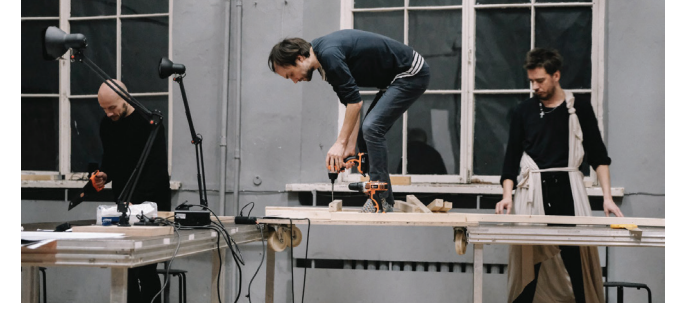
"Workshop", Kanuti Gildi SAAL.

An average of 50 companies per year produce new performances in Estonia. 26 theatres and theatre companies received support from the budget of the Ministry of Culture in 2018. These include state subsidised repertory theatres, municipal theatres, non-profit small theatres, foundations and dance companies. 11 of them have stationary repertories (incl. one with three genres – spoken-music-dance theatre, and one with two genres – music-dance theatre). This number also includes Russian theatre. The rest are project-based, private theatres or production houses.